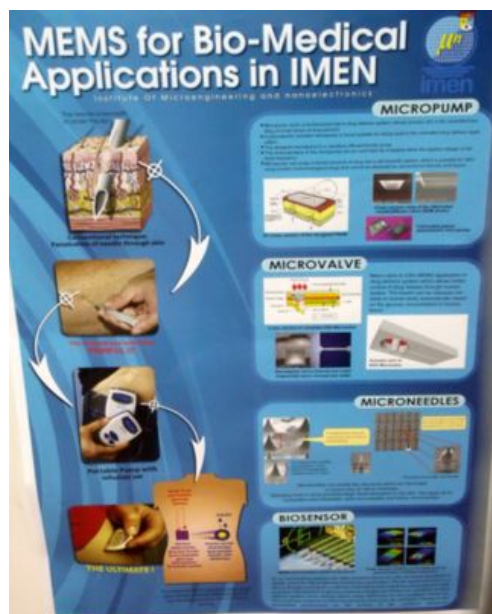
One of research areas in Institute of Microengineering and Nanoelectronics (IMEN)

High Resolution Illuminator & Dual Mode Fluorescence Module