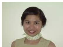
NanoGlobe NanoGlobe Pte Ltd

Home > Nanotechnology Columns > NanoGlobe > Nanotech Malaysia 2009 Conference and Exhibition