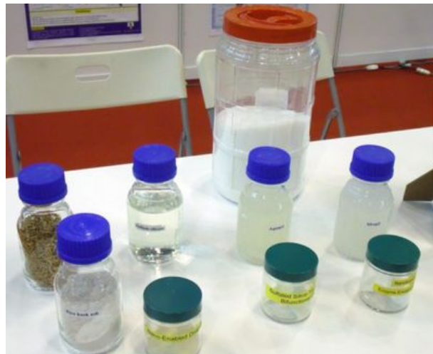
Rice husk R&D achievements of Universiti Teknologi Malaysia