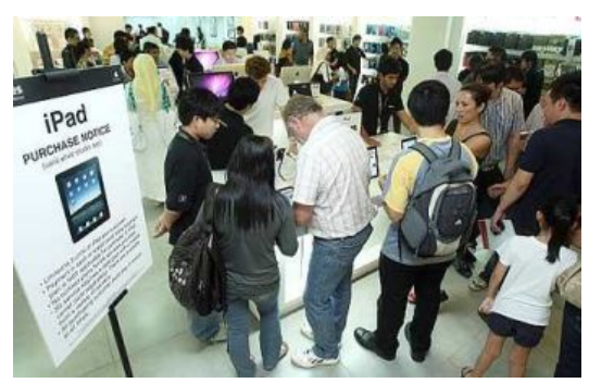
Eager beavers: There was a huge crowd at the launching of the Apple iPad at the Mid Valley Megamall in KL yesterday.

The iPad is designed to browse the web, read email, listen to music, browse photo albums, watch videos and read eBooks.